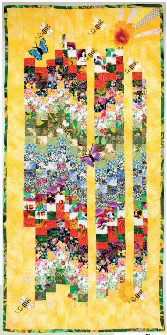
Butterflies and Bees